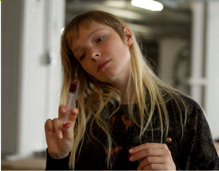
The Spiral. Produced by Caviar, Belgium. Developed with the support of the MEDIA Interactive support scheme.