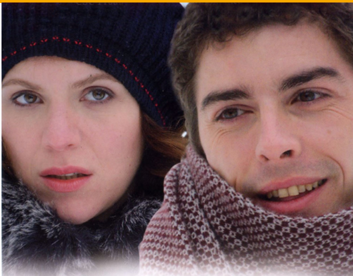
Dieci Inverni , 2009 – Production Company: Raicinema