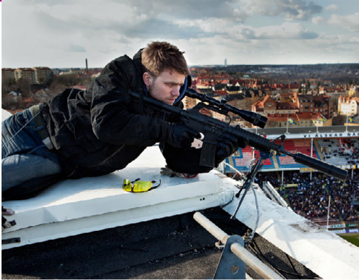
Drottningoffret (The Sacrifice), 2010 – Production Company: Bob Film.