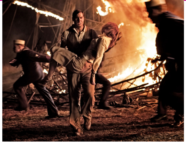
Hindenburg , a TV movie in two parts. Production company: teamWorx 2011 (supported by the MEDIA TV Broadcasting scheme).