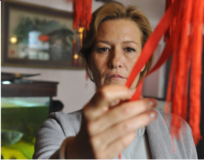
TV movie Der Chinese (The Chinese Man) , 2011- Production Company: Yellow Bird Pictures (supported by the MEDIA TV Broadcasting scheme)