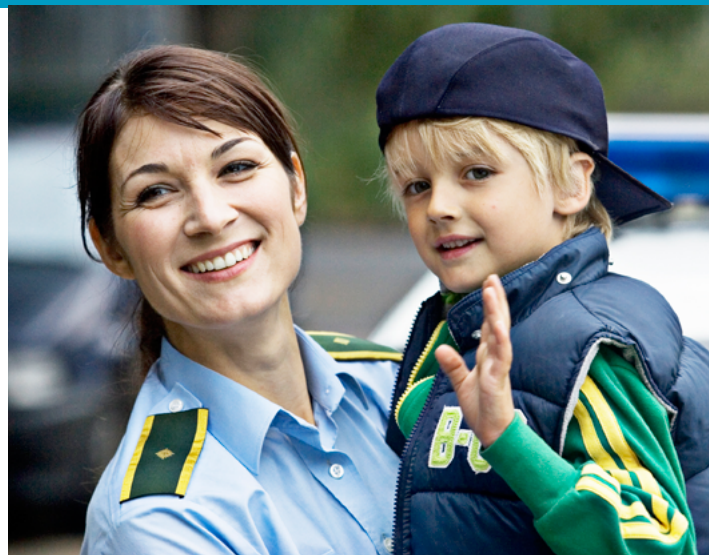
Anna Pihl , 2006. Production Company: Cosmo Film