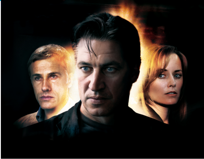
Das Jüngste Gericht, (The Last Judgement), 2007 – Production Company: Lisa Film