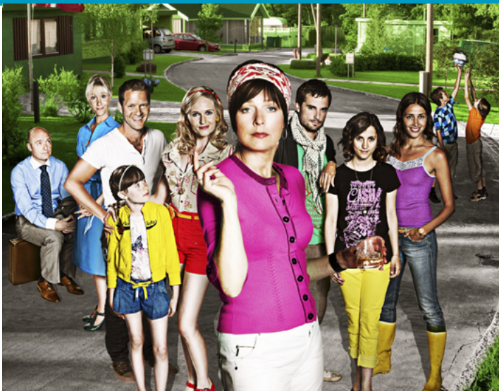
Lærkevej (Park Road) , 2009. Production Company: Cosmo Film