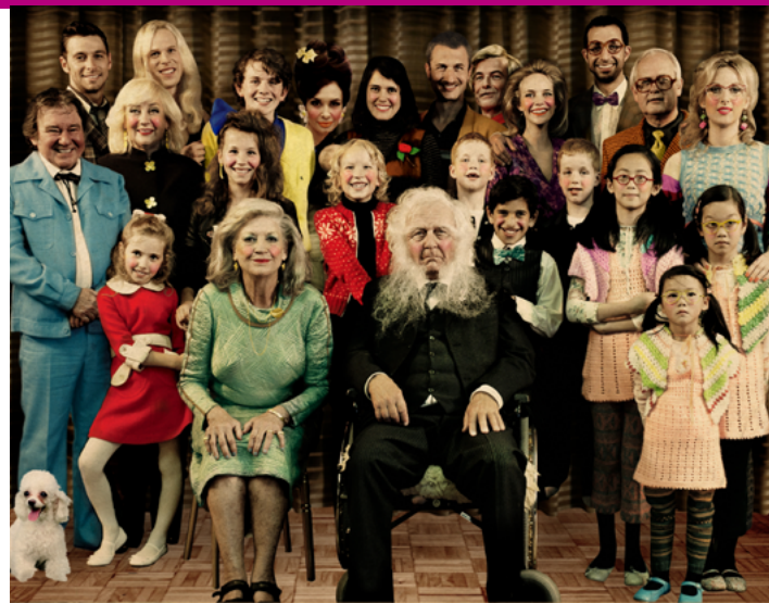
Het Gordijnpaleis van Ollie Hartmoed produced by Lemming Film co-produced by Willy Waltz (NL), A Private View (BE) and broadcaster VPRO, VRT. Developed with the support of the MEDIA Programme (Slate Funding). Released December 2011