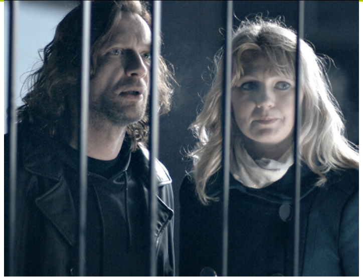
Alamaailma ( Underworld Trilogy ), 2011 – Production Company: Vertigo Oy