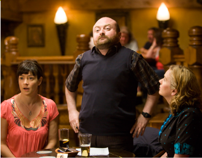
Trivia , 2010 – Production Company: Grand Pictures. Developed with the support of the MEDIA Slate Funding scheme.