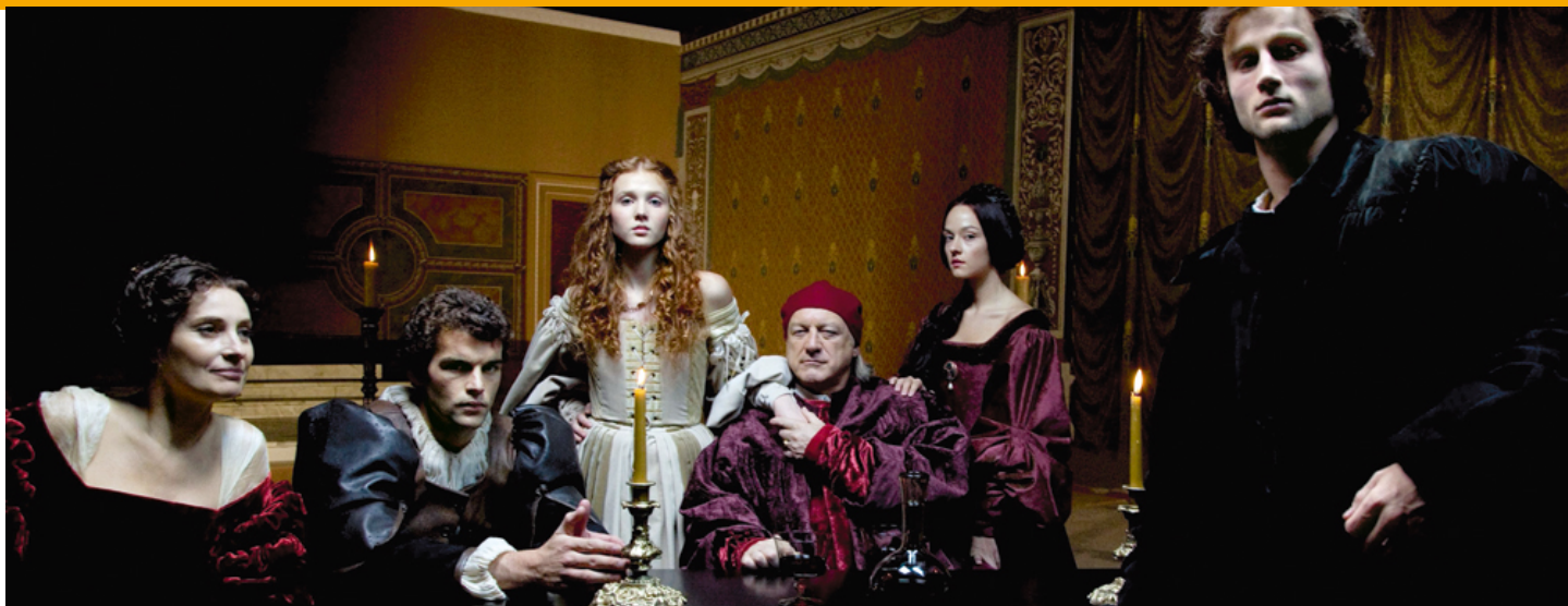
Borgia . Produced by Canal+, Atlantique and EOS with the support of the MEDIA TV Broadcasting scheme.