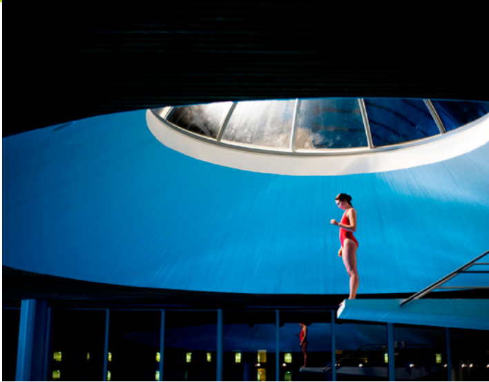
Jälkilämpö , ( Latent Heat ), 2009 – Production Company: Kinotar Oy