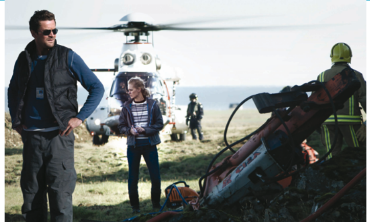
Both of these images are from The Cliff (Hamarinn) , 2009. Production Company: Pegasus.